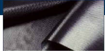
Mirafi® FW Woven Geotextile

BANK STABILIZATION / ROCK (ARMOR) UNDERLAYMENT Geotextile Placement Place the geotextile in close contact with the soil, eliminating folds or excessive wrinkles