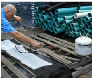
Our 3M representative demonstrating the spray pattern and holding power