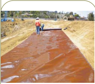
Rolling out RS580i high strength geotextile

In an effort to get out some new product information, we have changed this section to highlight a couple of new and exciting products that have come to market: