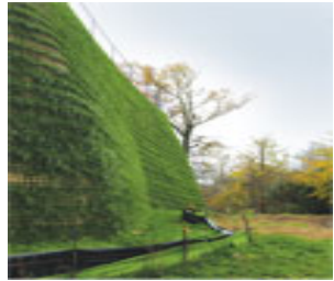
MSE Reinforced Slope vegetated with Flexterra HP-FGM