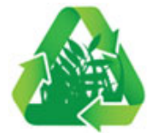
Green Design Engineering by Profile

http://aspent.com/files/2010/06/407.Flexterra_HP_FGM_Sell_Sheet.pdf